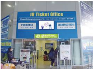
JR Kansai-airport Station Ticket Office [Business hours] 5:30 a.m. to 11:00 p.m.

Staff dedicated to offering support for foreigners is regularly available in the 2nd-floor JR-WEST Ticket Office of Kansai-airport Station. Feel free to stop by any time.