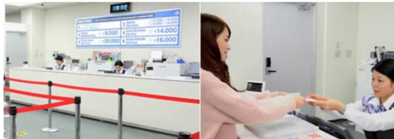
Counter on 2F specifically for overseas visitors to Japan [Business hours] 10:30 a.m. to 6:30 p.m. (Setup may change depending on time of year.)